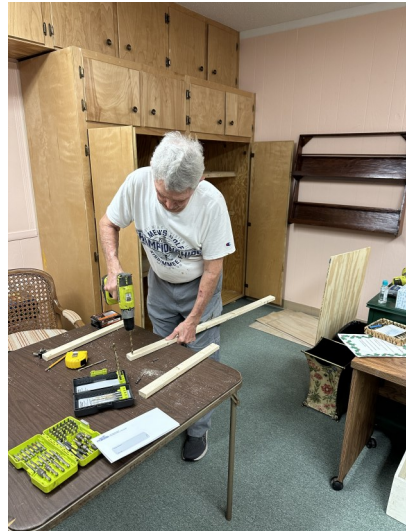
New flooring in the Eubank Hall to be installed next month.

Bottom pictures: Conference/Meeting rooms newly painted and new tables for meetings...Left is Room 4 and Right is Room 6.