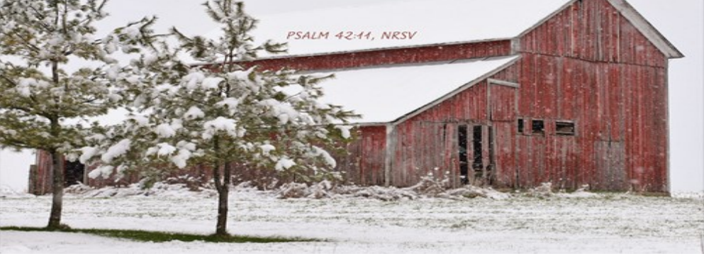
PSALM 42:11, NRSV

Hope in God; FOR I SHALL AGAIN PRAISE HIM, MY HELP AND MY GOD.